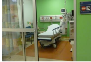
Go to room with bed