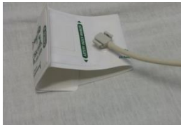
Measure blood pressure, quick tight hug on arm