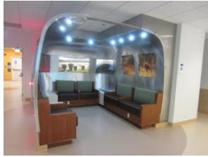
Check in and play in waiting room