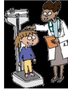
Get height and weight measured