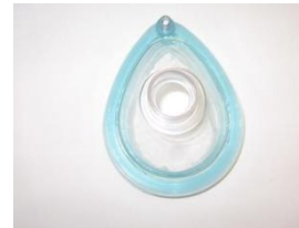
Pick scent for sleepy medicine