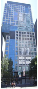
Go to the hospital