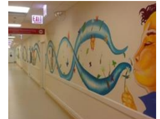
Take a ride down the hall on bed