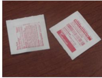
Clean the spot