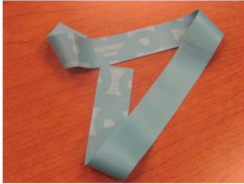
Rubber band goes around your arm